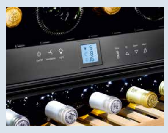
Electronic LCD display : Intuitive navigation of touch electronic control system enables tailored storage options. The digital temperature display can be viewed via the UV tinted glass door.