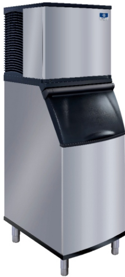
M420 Ice Machine on A420V Bin

Model: MD0420A-251B MY0420A-251B MD0420W-251B MY0420W-251B