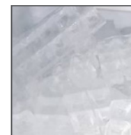
45 square cubes each cycle